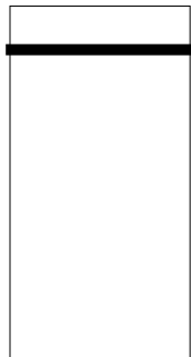
TIE WRAP KIT